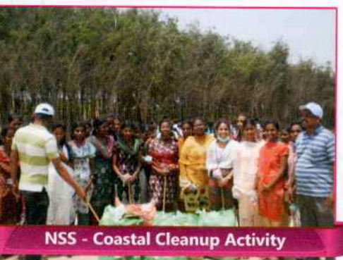
NSS - Coastal Cleanup Activity