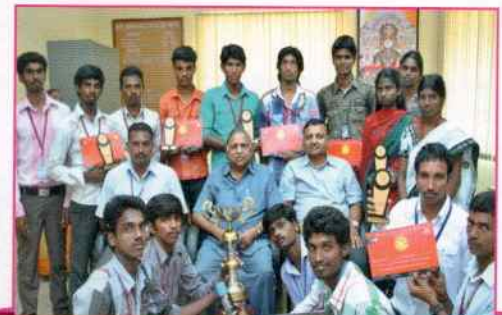
Rotaract Club - Cultural Event