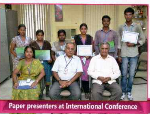
Paper presenters at International Conference