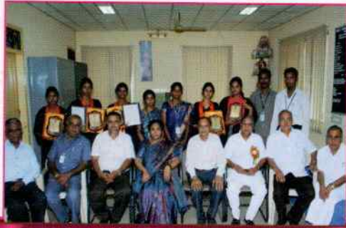
12 th Graduation Day