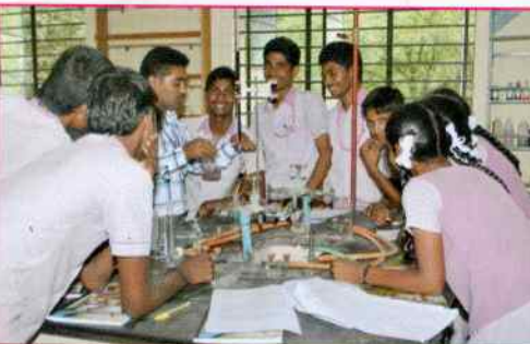
Hands on Practical Training to +2 Students at Chemistry, Computer Science, Physics / ECS Laboratories