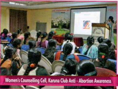
Women's Counselling Cell, Karuna Club Anti - Abortion Awareness