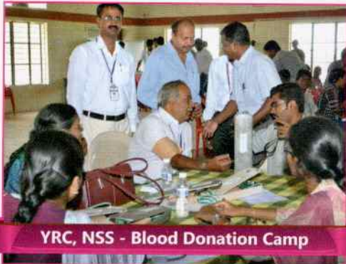
YRC, NSS - Blood Donation Camp