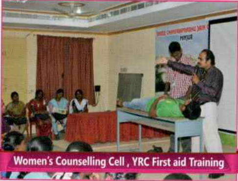
Women's Counselling Cell, YRC First aid Training