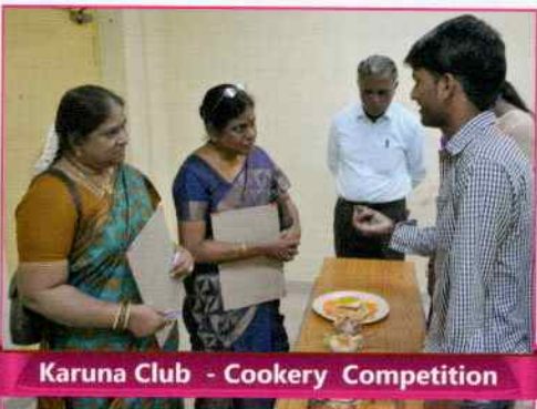
Karuna Club - Cookery Competition